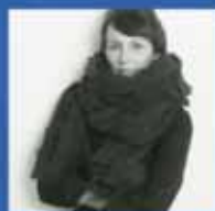
设计师: Sylvia Leydecker 设计公司: 100interiors 公司网址: www.100interior.de 项目地点: Munich, Germany