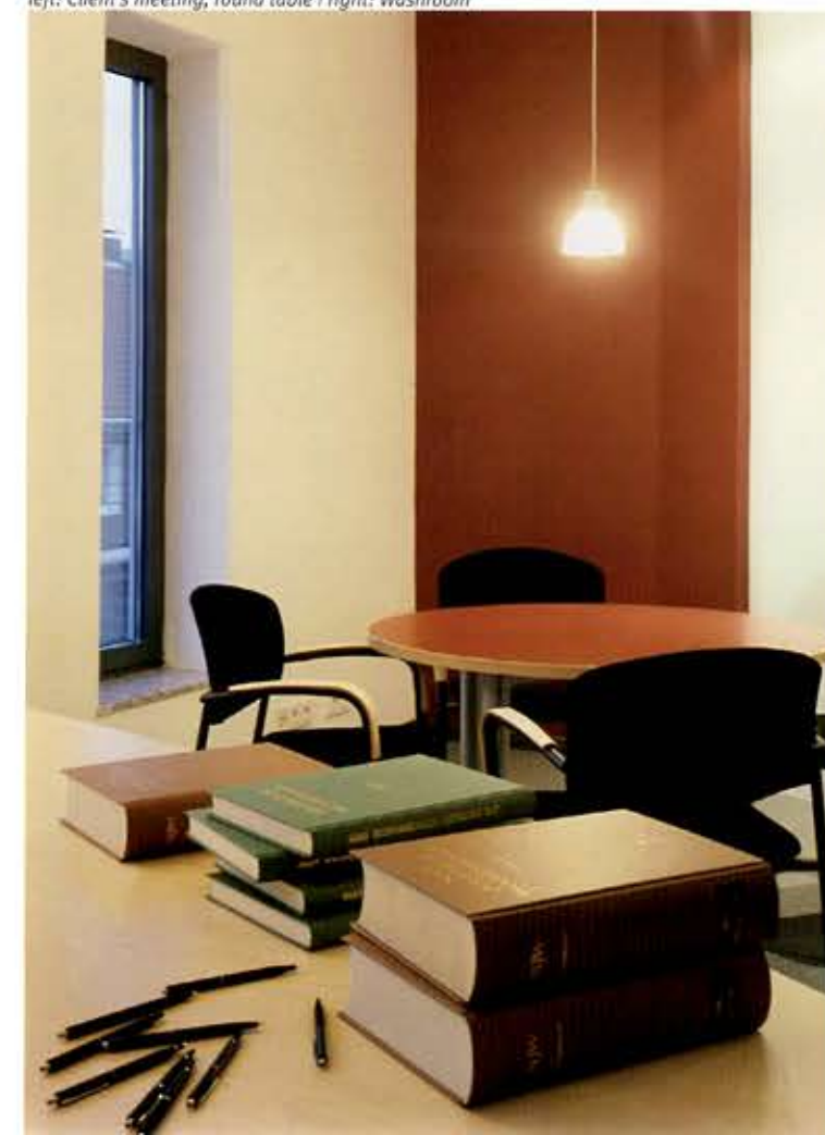
left: Client's meeting, round table | right: Washroom

A second reception area is used for special events, acting like a theater foyer set among offices. The style of interior design is consistently applied to all spaces, accentuating the team feeling for the employees, and completing the sense of the office being a modern, dynamic lawyers' enterprise.