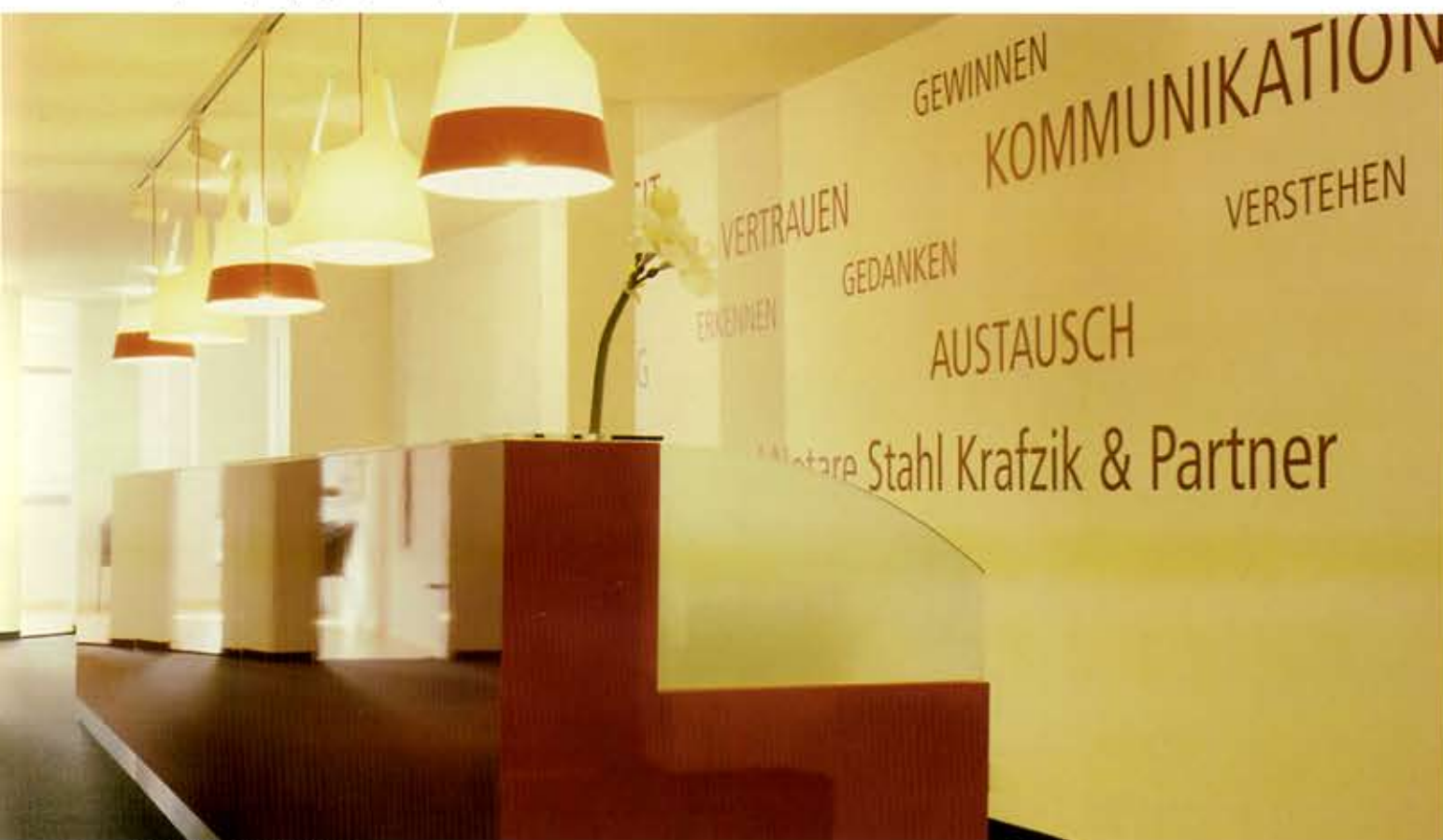
144 View reception area first floor