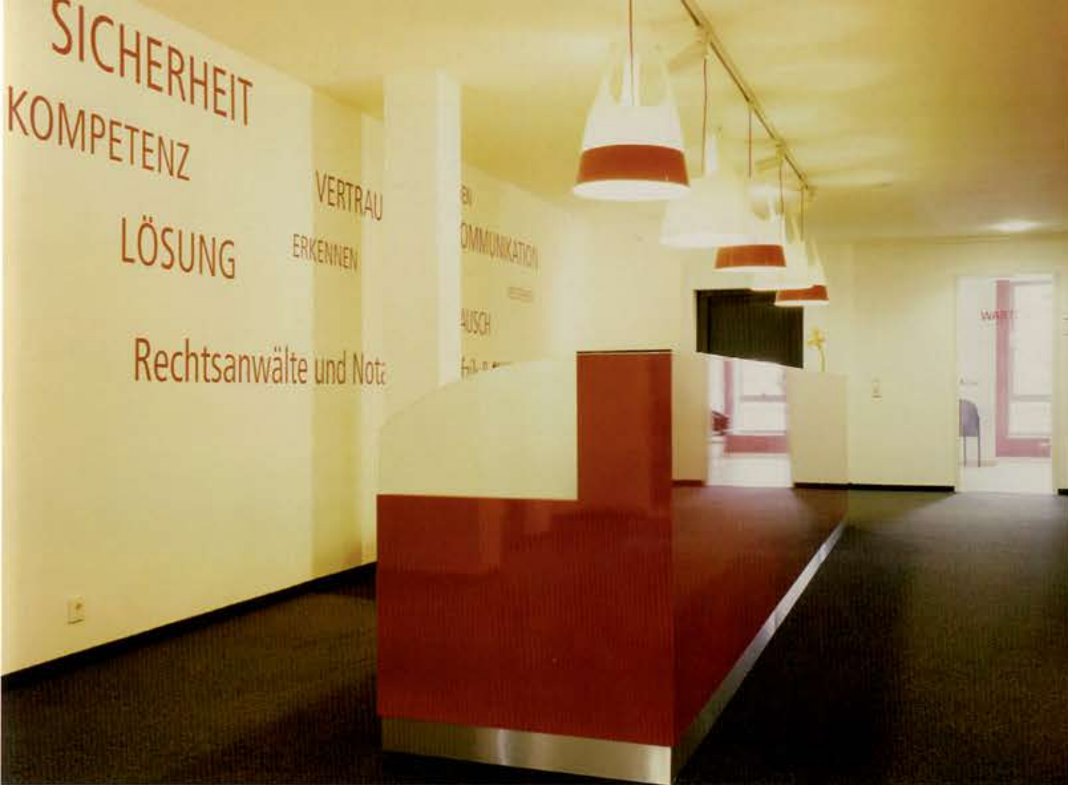
Reception area first floor, glossy red lacquered